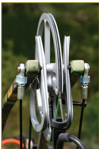
The distinctive cams on the Liberty I are widespread to better balance the entire bow and facilitate its shoot-through nature.