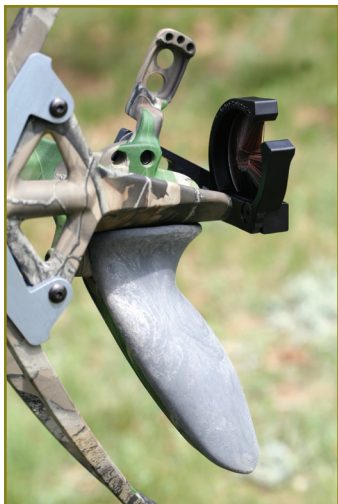
With its cushioned and angled grip, the Liberty I is a comfortable and pleasing bow to shoot.

One of the freshest, boldest new bows going is the Liberty I. The Liberty I is unique. It is the shortest, lightest adult compound bow on the planet. At just 20.5 inches from axle to axle and weighing just 2.3 pounds, the Liberty I is simply remarkable.